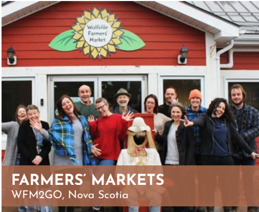
FARMERS' MARKETS WFM2GO, Nova Scotia