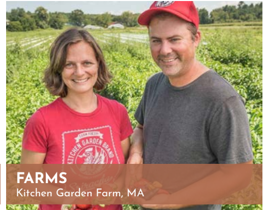
FARMS Kitchen Garden Farm, MA