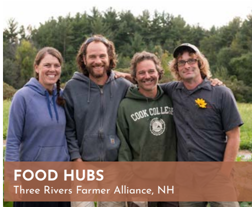
FOOD HUBS Three Rivers Farmer Alliance, NH